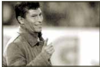
Krassimir Balakow (HCP 7)

Honours as Trainer: 2011 German Champion with HSV Hamburg, 2006, 2009 and 2010 Supercup with HSV Hamburg, 2013 Champions League Winner with HSV Hamburg, 2007 European Cup Winner with HSV Hamburg, 2006 and 2010 DHB-Pokal with HSV Hamburg, 2000 and 2010 Coach of the Year.