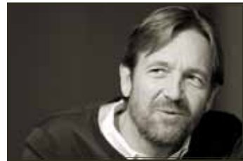
Martin Schwalb (HCP 11,6)

Honours: Kaiserslautern DFB-Pokal: 1995 - 96; Bayern Munich European Cup: runner-up 1986 - 87; DFL-Supercup: 1987; Inter Mailand Serie A: 1988 - 89, Supercoppa Italiana: 1989, UEFA Cup: 1990 - 91; Germany FIFA World Cup: 1990; runner-up 1986, UEFA Euro: runner-up 1992, Serie A Footballer of the Year: 1989; FIFA World Cup All-Star Team: 1990; Ballon d'Or Bronze Award: 1990