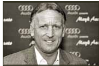
Andreas Brehme (HCP 13)

Honours: Coppa Italia Winner with AS Rom in 1991, DFB-Pokal Winner in 1997 with VfB Stuttgart, World Cup 2nd place 1986 in Mexico, World Football Champion in 1990 in Italy.