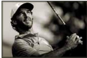
Karl-Heinz Riedle (HCP 10)

Coach: Danish Superliga with Herfølge BK 1999 - 2000 and with Brøndby IF 2004 - 05, Danish „Coach of the year 2000“