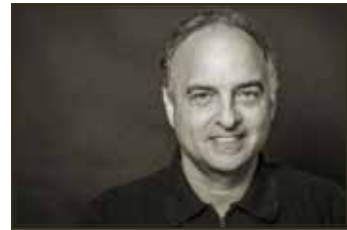
Hansi Müller (HCP 28)

Honours: German League Champion 2007 with VfB Stuttgart, German FA Cup runner-up 2007 and 2013, 3rd place at World Cup 2010 with Germany.